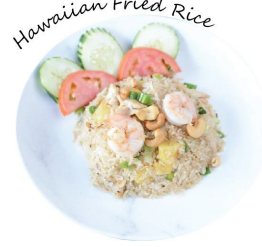
Hawaiian Fried Rice