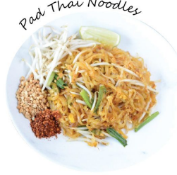
Pad Thai Noodles