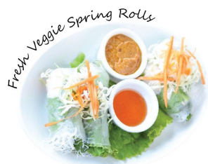
Fresh Veggie Spring Rolls

Tom Kah: Spicy coconut soup and fresh mushrooms Tom Yum: Hot and sour soup and fresh mushrooms Veggie Soup: Tofu and mixed vegetables in clear broth